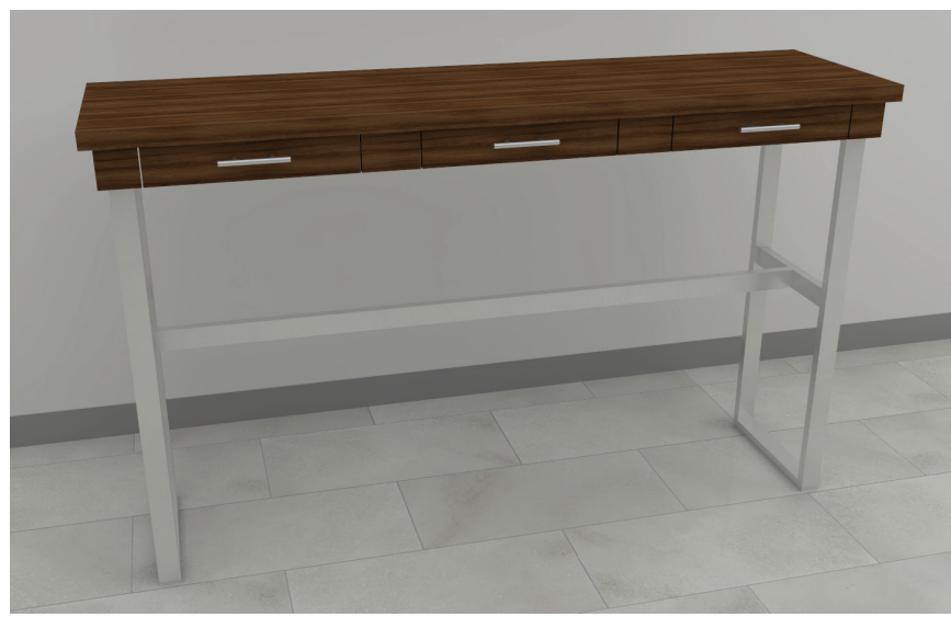
HARD ROCK MAPLE