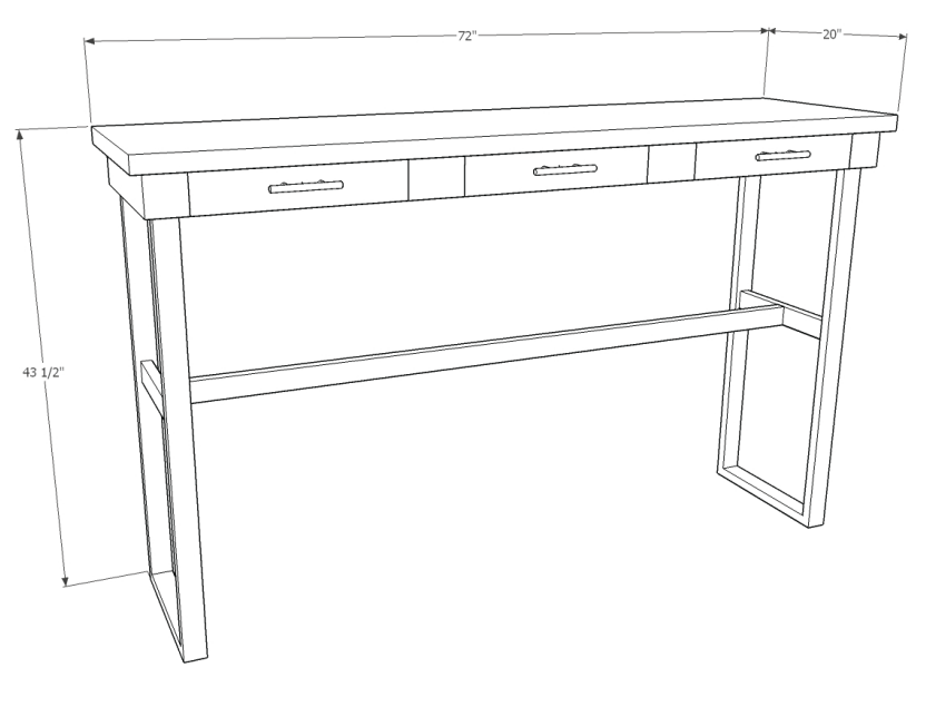
72"W x 43 1/2"H x 20"D